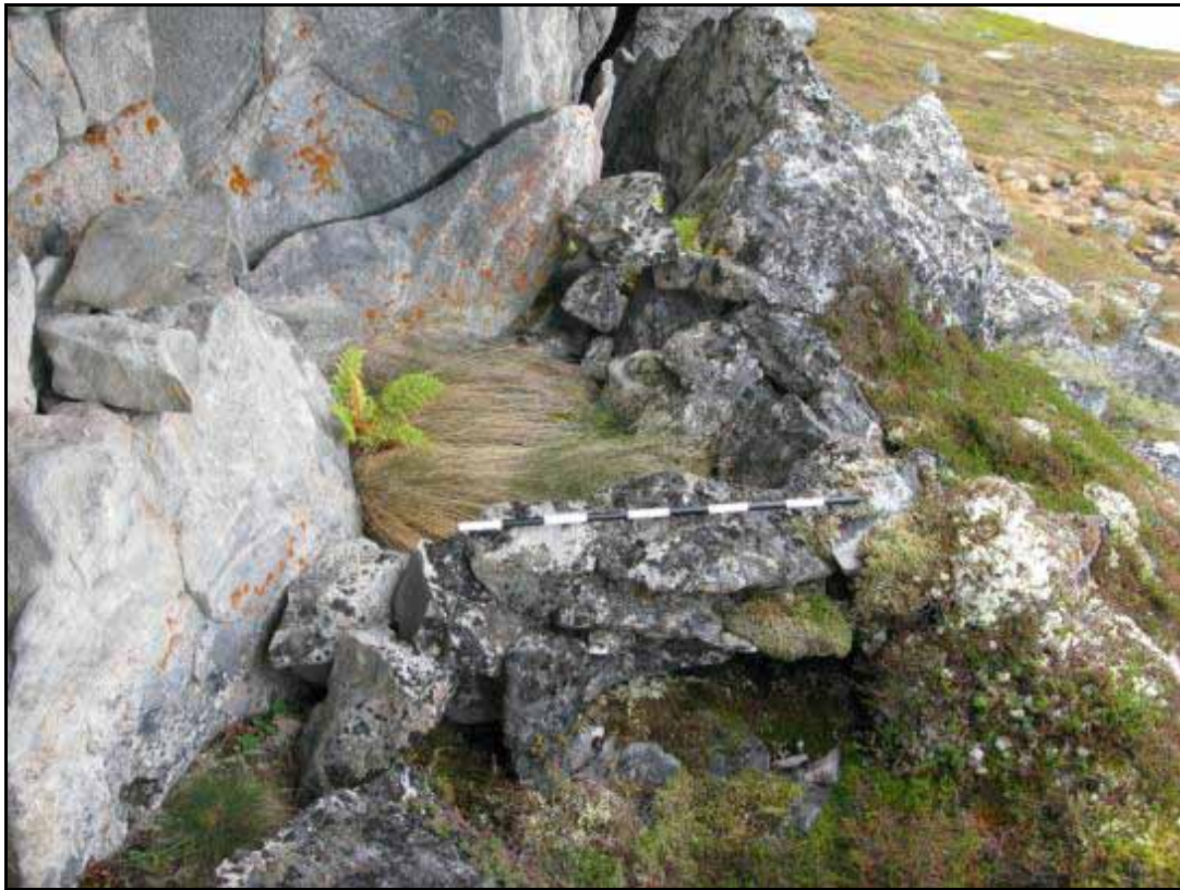
FM 63V2-III-38: Shelter built under a cliff overhang

FM 63V2-III-40: Part of a hunting drive for caribous. The system is situated along the river on the SE bank. The drive consist of 8 head sized or smaller stones placed on the cliff and some boulders. Position: N 63°01'59.8" / W 050°20'06.2" Position of the cairns making part of a drive: